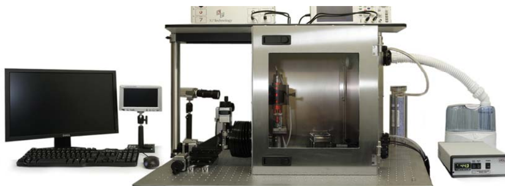
Figure 1. KP Technology RHC020 Corrosion/Environmental Housing Kelvin Probe System.

Electrochemical or mechanochemical behaviour of a surface, such as corrosion or corrosive wear, is extremely complicated and involves various chemical, physical and mechanical factors. To gain a thorough insight into such a complex phenomenon, it is necessary to understand the role of each factor. In this study, the influence of surface morphology, represented by roughness, on the corrosion and electronic behaviour, represented by the electron work function (EWF), of copper was investigated using an atomic force microscope and a scanning Kelvin probe. Experimental results showed that the corrosion rate increased with an increase in surface roughness, whereas its surface EWF decreased. It was theoretically demonstrated that roughness can decrease the average EWF but increase the fluctuation of the local EWF. Such fluctuation could promote the formation of microelectrodes and, therefore, accelerate corrosion. The study demonstrates that the surface morphology can make a considerable contribution to corrosion and thus corrosive wear.