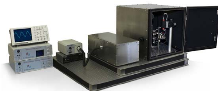
Figure 1. KP Technology SPS030 System.

The surface photovoltage (SPV) method is a well-established technique for the characterisation of semiconductors, which provides both optical and transport properties of different regions in the material under study, with high sensitivity to defect states in the sample at its surface, bulk, or any buried interface. The detected SPV response depends on the light absorption, charge separation, and charge transport properties of the system under investigation. A Kelvin probe (KP), as the first elaborate equipment for SPV detection, measures the surface work function and follows the change in the surface potential under steady illumination, which is sensitive to surface charge changing due to either a fast or a slow process.