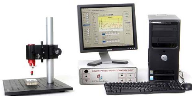
Figure 1. KP Technology KP020 System.

Changes in the work function during exposure to the analytes were monitored under ambient conditions by measuring the electrical potential of contact free surfaces relative to that of a gold reference, using a commercial Kelvin probe system (Kelvin Probe System, KP020). The Kelvin probe package included a head unit with integral tip amplifier, a 2mm tip, a PCI data acquisition system, a digital electronics module, the system software, an optical baseboard with sample and Kelvin probe mounts, a 1" manual translator, and a faraday cage. The Kelvin probe data were collected for three or more different samples and averaged.